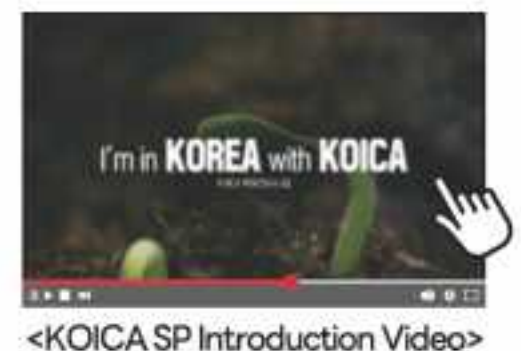
<KOICA SP Introduction Video>

Please ensure that applicants who have passed the local interview* for the 2025-1 KOICA Scholarship Program are not eligible to apply for the 2025-2 KOICA Scholarship Program. *conducted by the KOICA Overseas Office or Korean Embassy